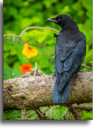
Crows in my backyard. Images by Carmay Knowles

between the birds in flight. What I learned was that crows' tail feathers are all the same length, so when they are in flight they fan out with an even edge like a Japanese fan—almost square looking. The middle tail feathers on a raven, however, are longer than their outside tail feathers, so that when the raven is in flight, the tail feathers seem to be pointing backwards or are more diamond shaped. There are many other differences for sure, but I hope this brief summary helps when you are out in the field, at the beach or in your yard looking at those "big black birds."