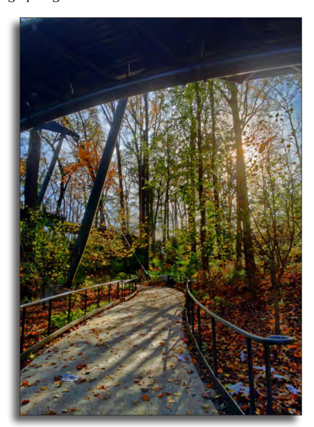
Botanical Garden, Atlanta, GA - by Brooks Leffler It's not exactly next door, but I love the Botanical Garden in Atlanta, GA. Most impressive is the network of catwalks through the forest, varying in height from ground level up to 40 feet, winding through a native grove of 150-foot tulip-poplars. The walkways are fully accessible, and I can ride my scooter the whole length of the walk — maybe a half mile in total.