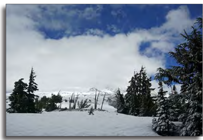
Mt. Hood, Oregon

Portland, Oregon has a vast wealth of photo opportunities, both in the city and around the area without a long drive. This particular photo is actually the farthest away from Portland, Mt. Hood - about 90 minutes away.