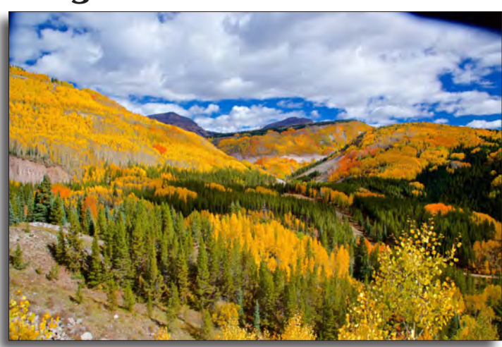
Fall colors in Colorado - by Gerald Gifford In the Fall of 2015 and again in Fall 2016, my wife and I embarked on road trips with the goal of viewing and photographing Fall colors.

Portland, Oregon has a vast wealth of photo opportunities, both in the city and around the area without a long drive. This particular photo is actually the farthest away from Portland, Mt. Hood - about 90 minutes away.